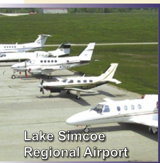
Lake Simcoe Regional Airport

This airport is located outside Toronto's busy airspace, just 20 km. south of Orillia off Highway 11 and offers a 5,000 ft. paved and lighted runway, Global Positioning System, aviation fuel: 100LL and Jet-A, instrument approach, Canada Customs, passenger and freight charter service and flight training.