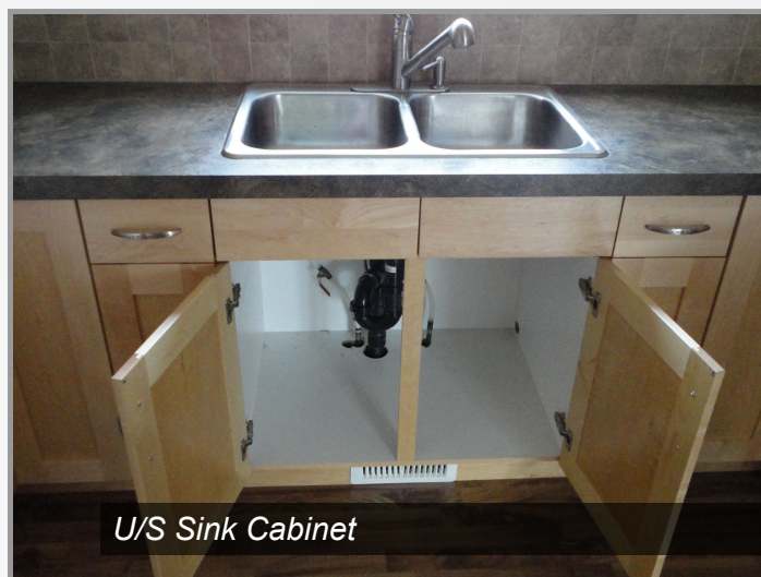
U/S Sink Cabinet