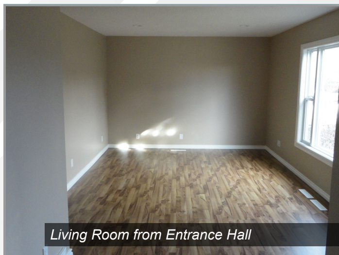
Living Room from Entrance Hall