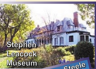
Stephen Leacock Museum