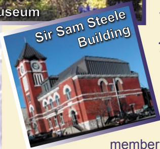
Sir Sam Steele Building