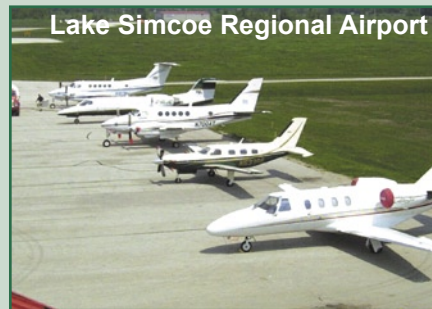
Lake Simcoe Regional Airport