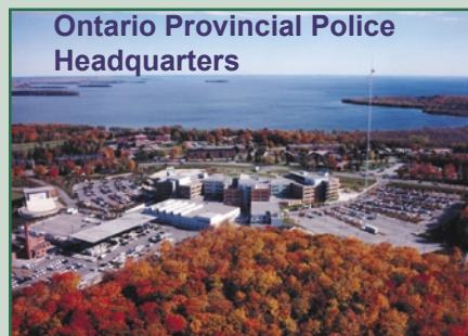
Ontario Provincial Police Headquarters